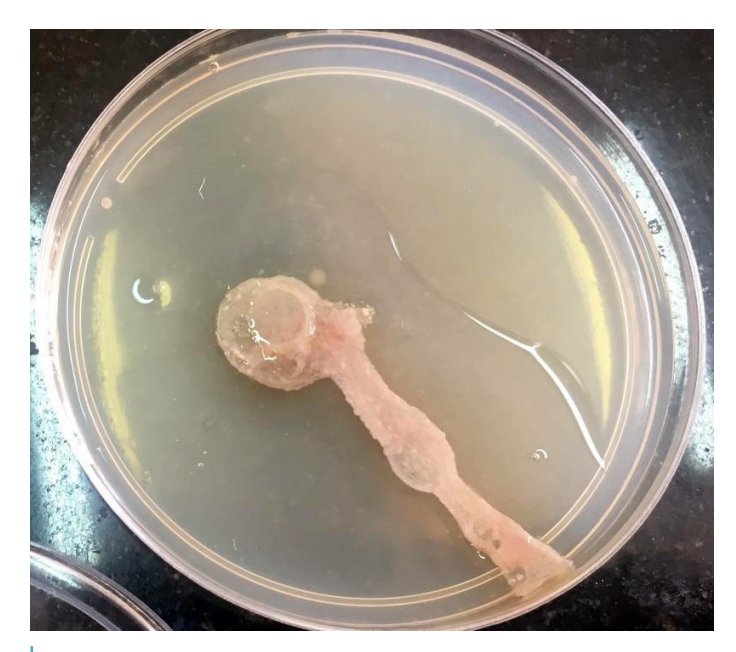
Figure 2. Migratory Tract in Agar Plate of Sputum Samples

We present a case with the first discovered UCTD, which was presented by pulmonary strongyloidiasis without HS.